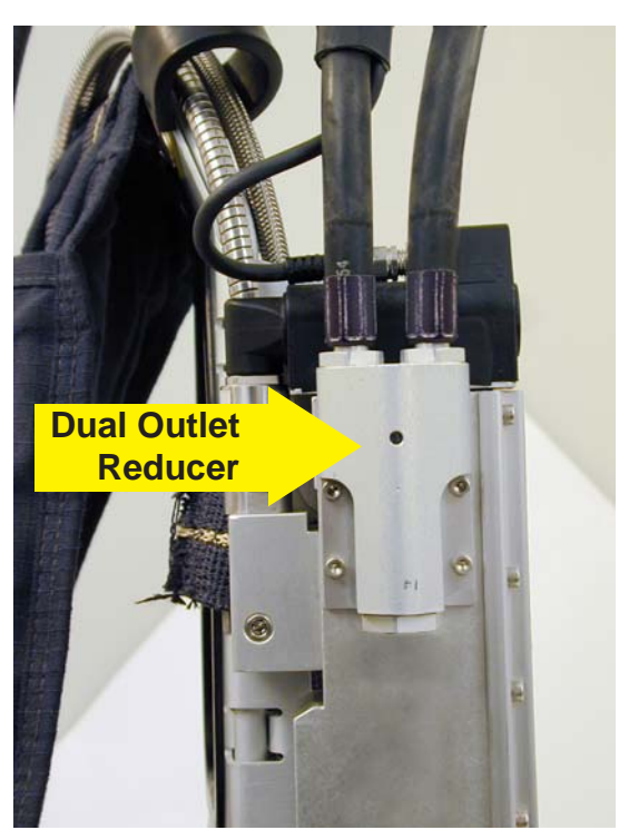
FIGURE 2 – Dual Outlet Pressure Reducer