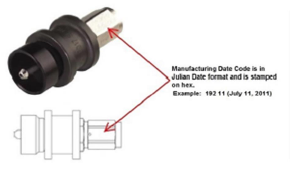
Figure One - Female Coupling

Note: If the date code stamped on the coupling contains six digits, use only the first five digits to determine the date code of the coupling.