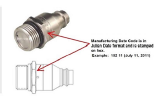
Figure Two - Male Coupling