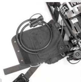
ExtendAire II System