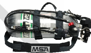
RescueAire II System