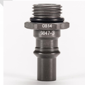
New Male Quick Connect Fitting

Again, we apologize for any inconvenience that this situation may cause; however, your safety and continued satisfaction with our products is most important to us.