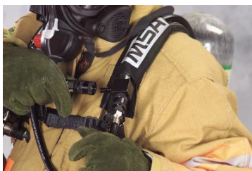
ExtendAire I System

We received three reports indicating that, during training exercises, the intended recipient of air did not receive air after a secure connection was made to the donor's tee manifold of an ExtendAire I equipped Air Mask. The donor continued to receive air.