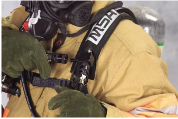
ExtendAire I System