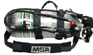
RescueAire II System