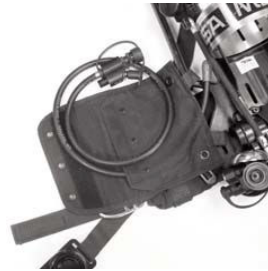
ExtendAire II System