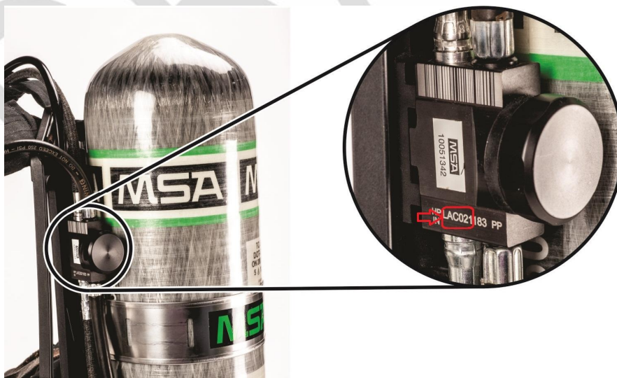
Air Mask Serial Number Location – Refer to First Six Digits

Refer to the photos below to locate the first stage regulator serial number.