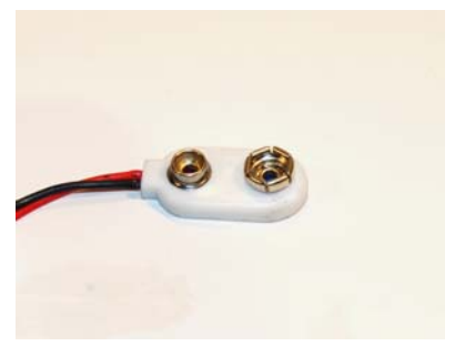
Figure 4 White Six- (6) Point Battery Terminal Connection COMPASSes with this connection do NOT have to be replaced.

As specified in NFPA 1500 and the COMPASS user manual instructions, the COMPASS should be tested at least weekly and <u>prior to each use</u>. If your COMPASS is configured with a <u>black six-point</u> terminal connection, <u>remove the SCBA from service immediately</u>, and have the COMPASS replaced by a certified technician before the SCBA is put back into service. <u>Ensure that you read the Addendum on the next page</u>. This Addendum was not included in the original March 26, 2010 publication of this Safety Notice.