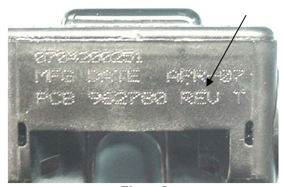
Figure 5 COMPASS Manufacturing Date

COMPASS devices that may have this problem have engraved manufacturing dates between July of 2005 and June of 2006 (the manufacturing date is engraved into the wide end of the COMPASS; see Figure 4 ); however, we strongly recommend that you check all COMPASS units in your possession as the breaks may precede or follow these dates of manufacture.