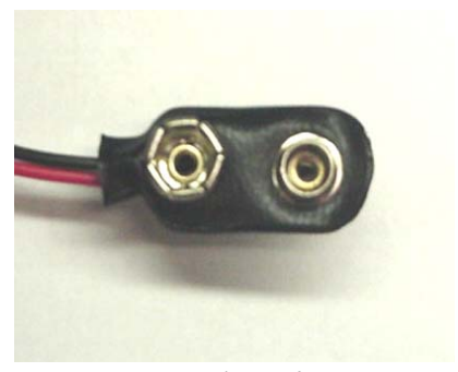
Figure 3 Black Six- (6) Point Battery Terminal Connection COMPASSes with this connection have to be replaced.