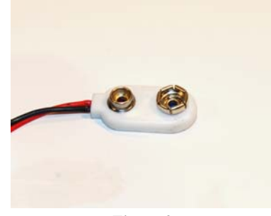
Figure 3 White Six- (6) Point Battery Terminal Connection COMPASS units with this connection must have foam inserts installed.

New Course of Action: Sperian Respiratory Protection will provide, under warranty, foam inserts that must be installed, per the accompanying instructions, into the battery compartment of the COMPASS unit. This will prevent the battery terminal connection from losing contact with the battery. Installation may be performed by the end user and does NOT have to be performed by a Sperian-certified technician. Installation of the foam insert must be made to any COMPASS that is found to have the black six- (6) point or white six- (6) point battery terminal connection, regardless of age. Installation of the foam insert does NOT have to be made to a COMPASS with a black four- (4) point battery terminal connection.